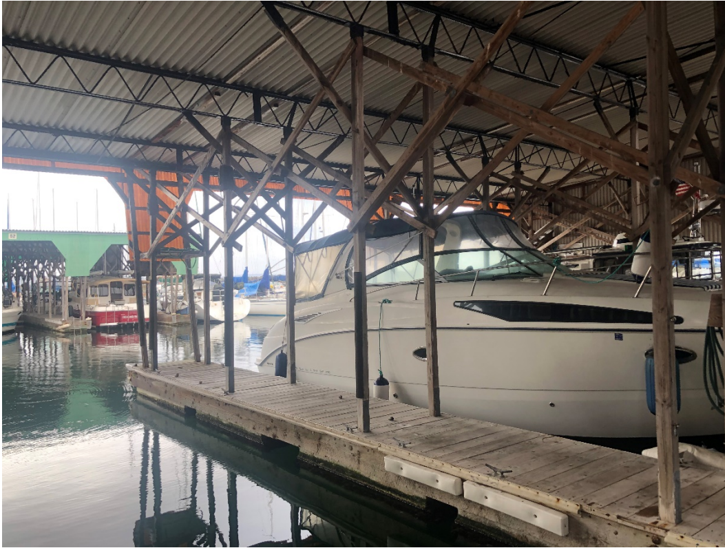
Photo 13. Covered Moorage System Timber Float