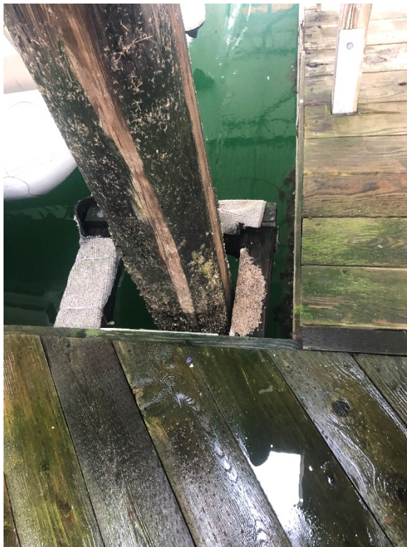
Photo 12. Timber Pile with Abrasion