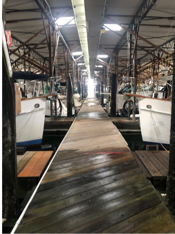
Photo 7. Covered Moorage System