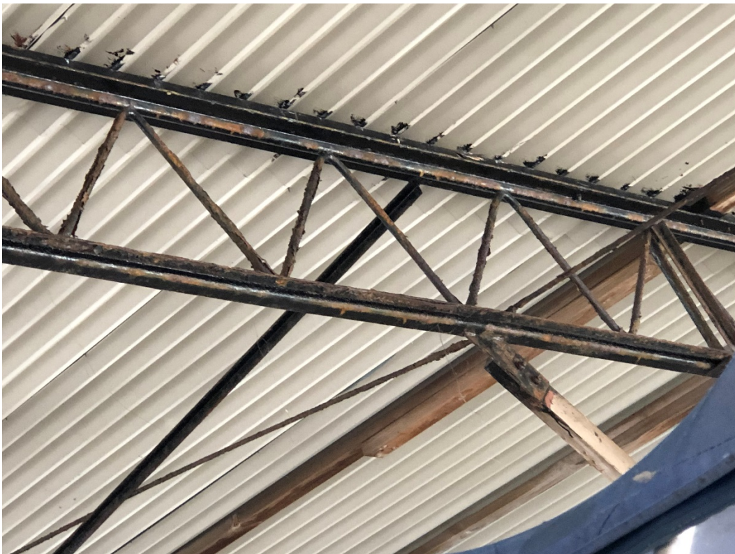
Photo 8. Roof Truss Corrosion