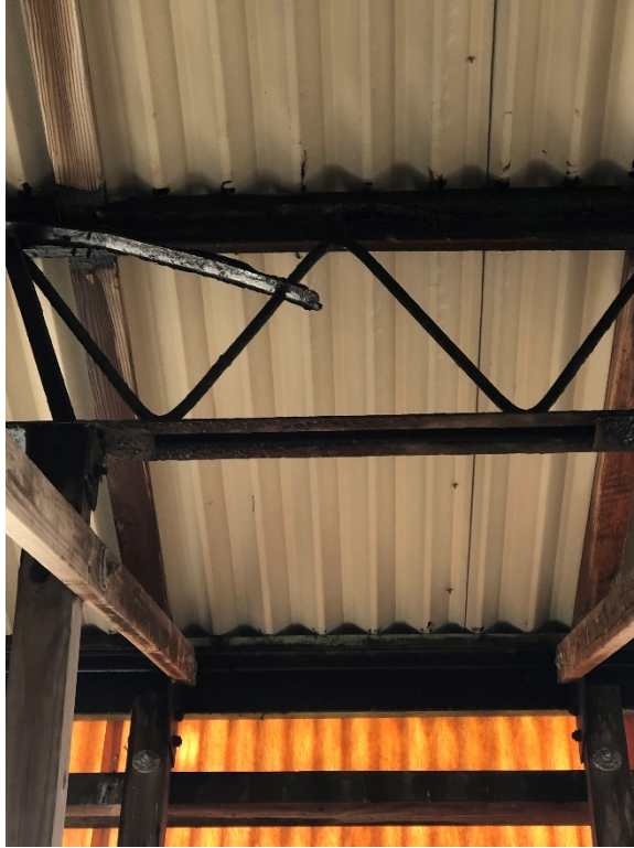
Photo 9. Roof Truss Damage