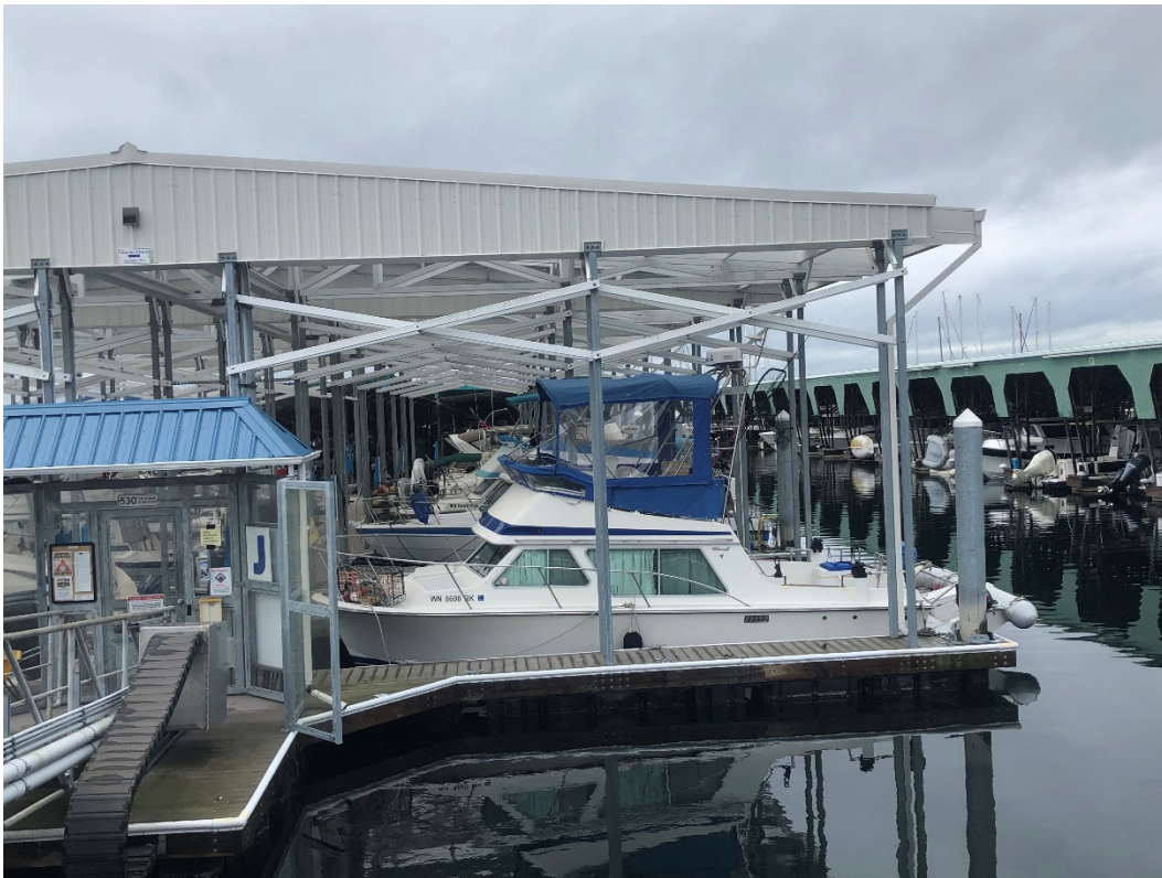
Photo 16. New J Dock Covered Moorage System