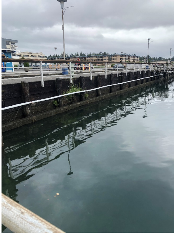
Photo 19. Seawall