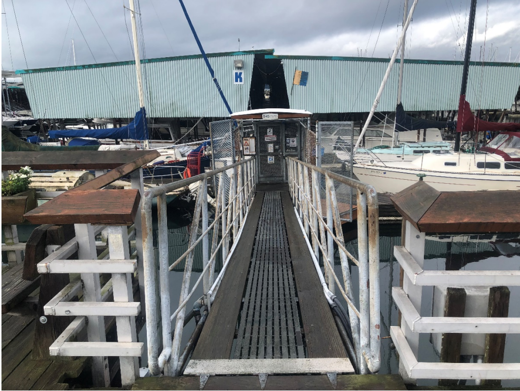
Photo 17. Gangway and Covered Moorage