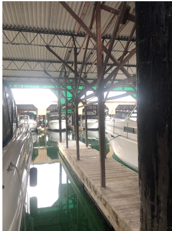
Photo 6. Timber Framing and Roof Structure