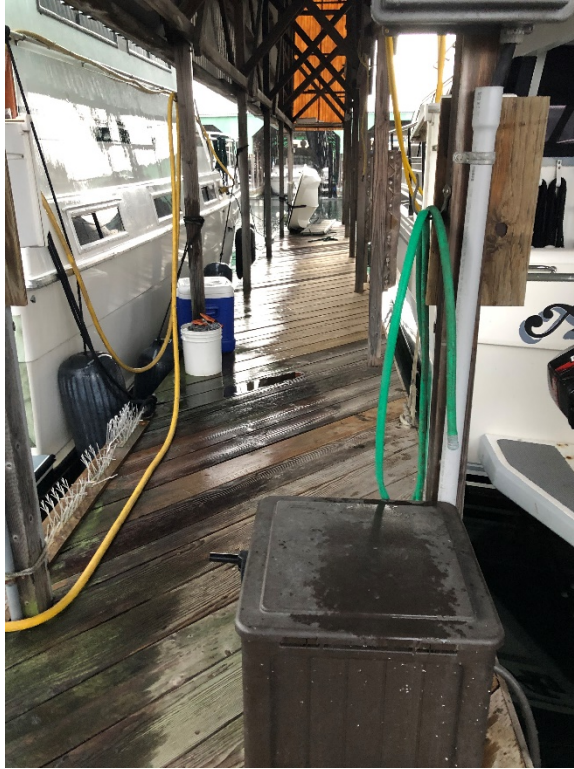
Photo 3. N Dock Timber Finger