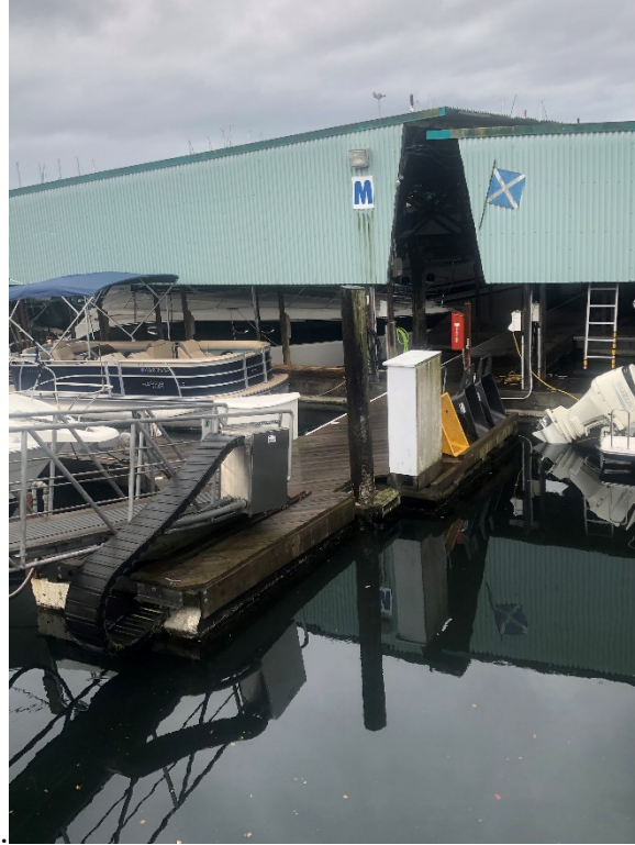
Photo 5. M Dock Roof Structure