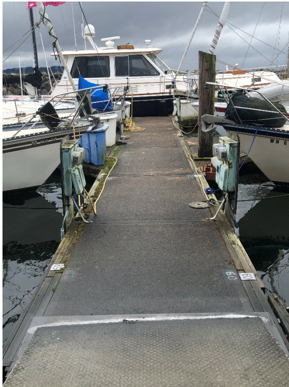
Photo 10. Outer Uncovered Concrete Dock System