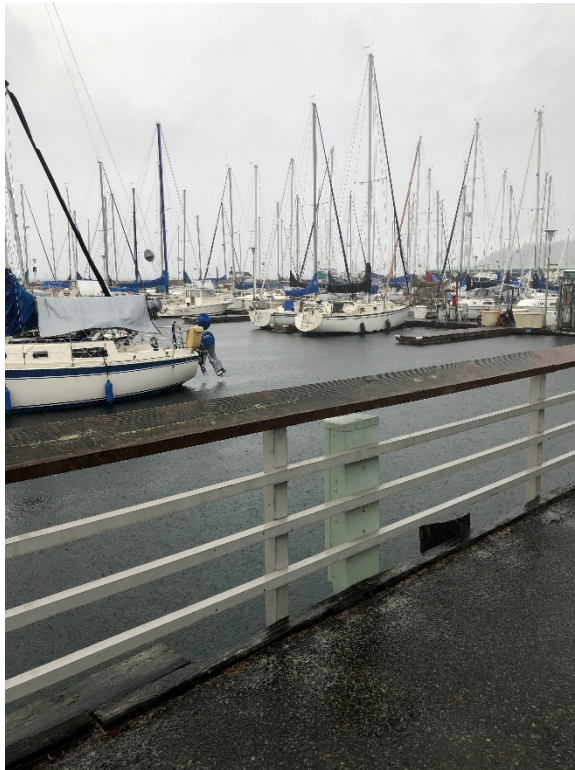
Photo 20. A and B Concrete Docks