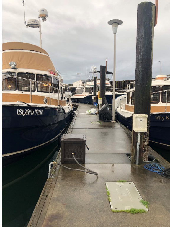
Photo 1. Commercial Dock