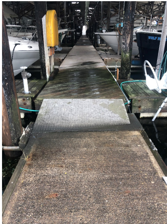
Photo 14. Transition from Timber to Concrete Dock