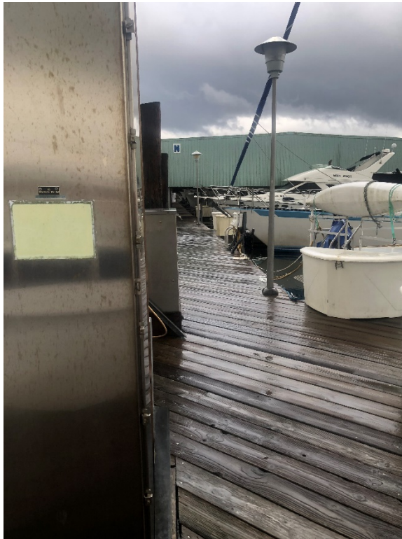
Photo 4. N Dock Open Timber Float