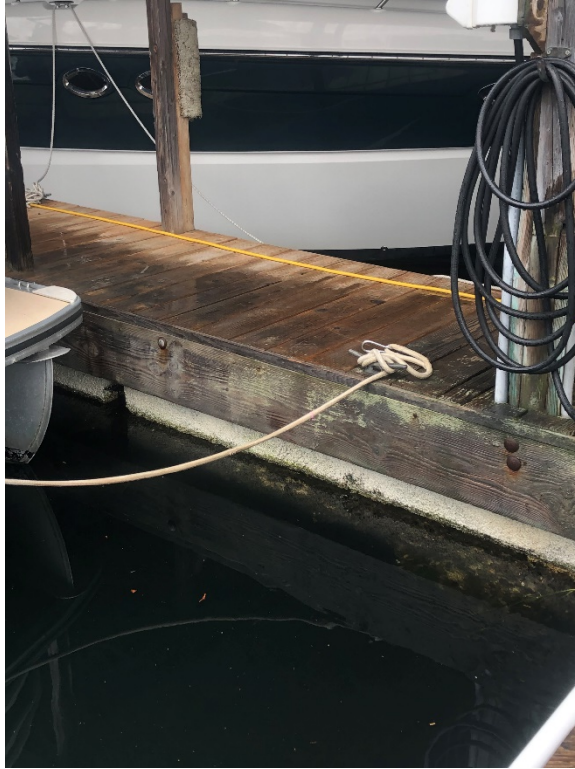
Photo 11. Timber Float with Unencased Flotation