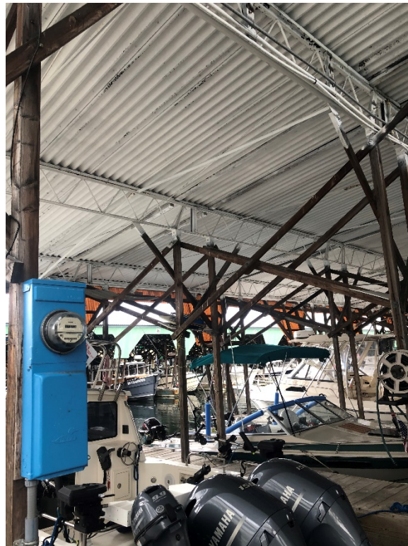
Photo 18. Electrical Service and Painted Truss