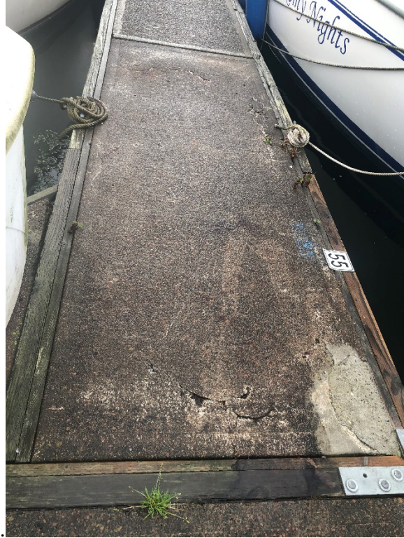
Photo 15. Outer Concrete Float Showing Deterioration