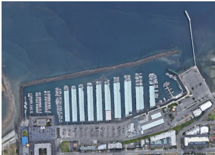
Figure 1. Des Moines Marina.

As part of the overall process, the City of Des Moines requested that Reid Middleton perform an evaluation to determine the estimated remaining design life of the inwater portions of the marina moorage dock facilities. The intent of the evaluation is to estimate when the inwater moorage facilities will require replacement to enable the City to plan effectively for replacement of the aging inwater facilities. The estimated design life remaining along with the planning work being conducted by others will assist the City in determining appropriate phasing and replacement timing for major capital rehabilitation projects for the marina facility. This report provides a summary of the estimated remaining life for the inwater moorage dock facilities at the marina.