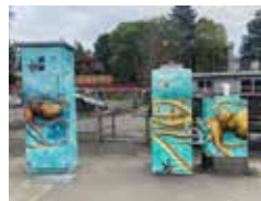
TITLE: OCTOPUS LOCATION: 22600BLK PACIFIC HWY S: EAST SIDE