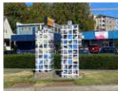
TITLE: SILVER LINING LOCATION: 21600BLK MARINE VIEW DR. S: EAST SIDE