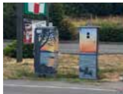
TITLE: BEACH PARK SUNSET LOCATION: KENT-DES MOINES ROAD / MARINE VIEW DR. S: NORTHEAST CORNER