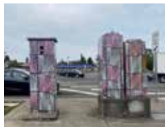
TITLE: PINK ICHIMATSU LOCATION: S KENT-DES MOINES ROAD / PACIFIC HWY S: CENTER ISLAND, NE CORNER