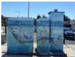
TITLE: WELL HELLO THERE LOCATION: S 216TH ST / PACIFIC HWY S: SW CORNER OF THE INTERSECTION

More information about the new installations and future opportunities for art can be found at the Des Moines Arts Commission website at: www.desmoinesartscommission.com