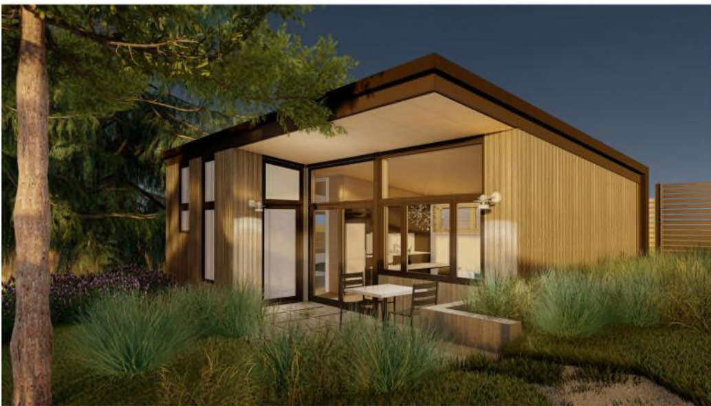
Cedar Cottage Seattle ADU Pre-Approved Plan (above and below). Credit: CAST architecture.

Seattle: Pre-approved DADUs Program – Offers 10 pre-approved plans for DADUs, including factory-assembled structures that have been approved by the Washington Department of Labor and Industries.