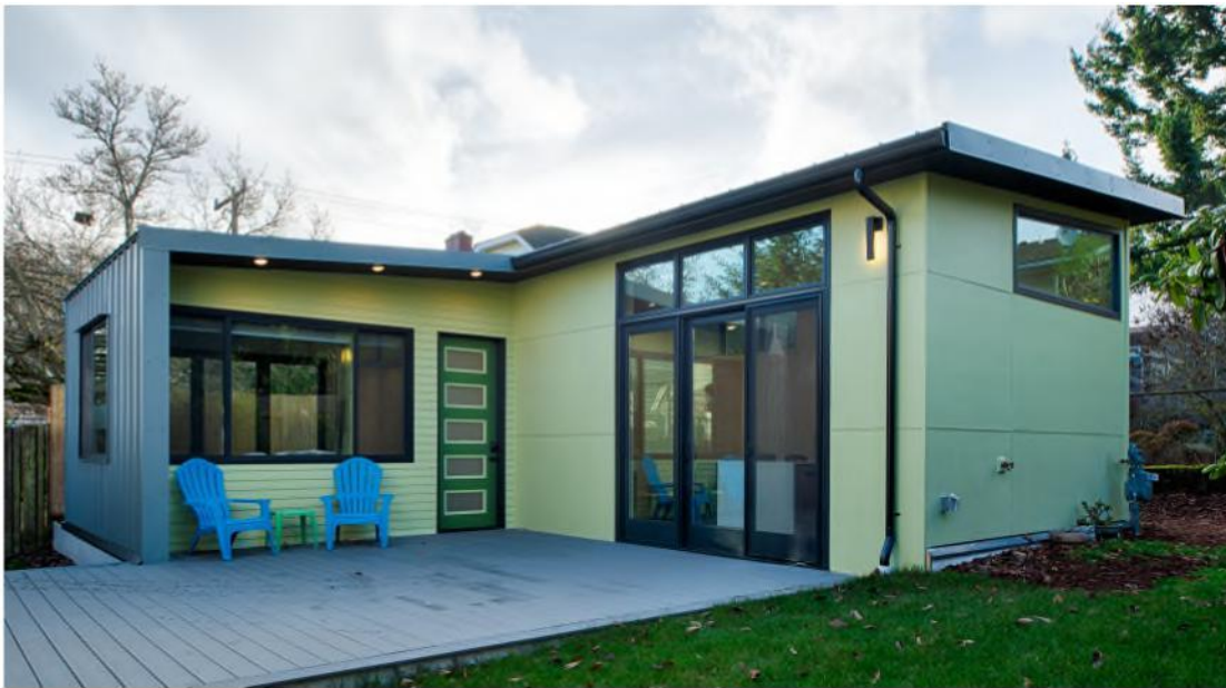
Smith Gillman Cottage converted garage. Credit: CAST architecture.

Sumner Municipal Code Sec. 18.12.030 – ADUs created via garage conversion are not required to have off-street parking, as long as there is available on-street parking and the unit is located within half a mile of the Sumner transit station.