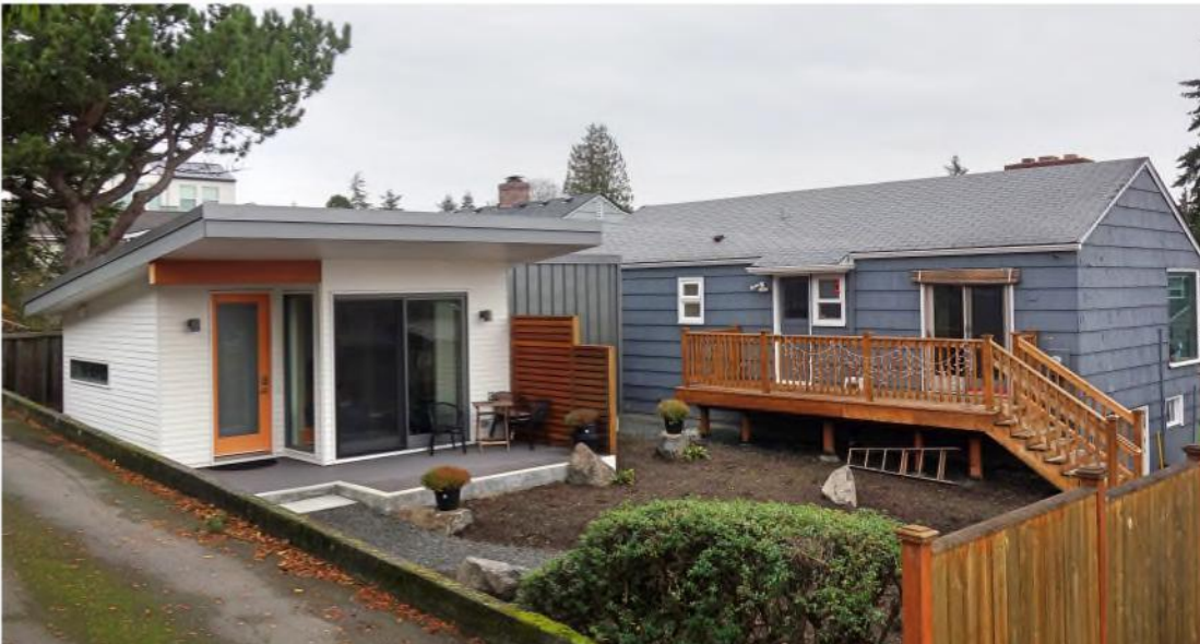
ADU in the Wedgewood neighborhood of Seattle.

Lacey Municipal Code Sec. 14.23.071 – Has minimal design criteria for attached and detached ADUs, though duplex-like designs are not allowed.