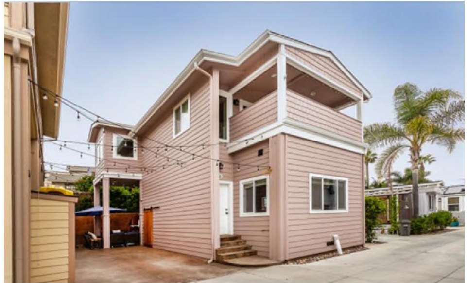
Larger, taller DADU – 1130 SF.

Spokane Municipal Code Sec. 17C.300.130 – Has height limits that are more nuanced and relate to the proximity of an ADU to a property line.