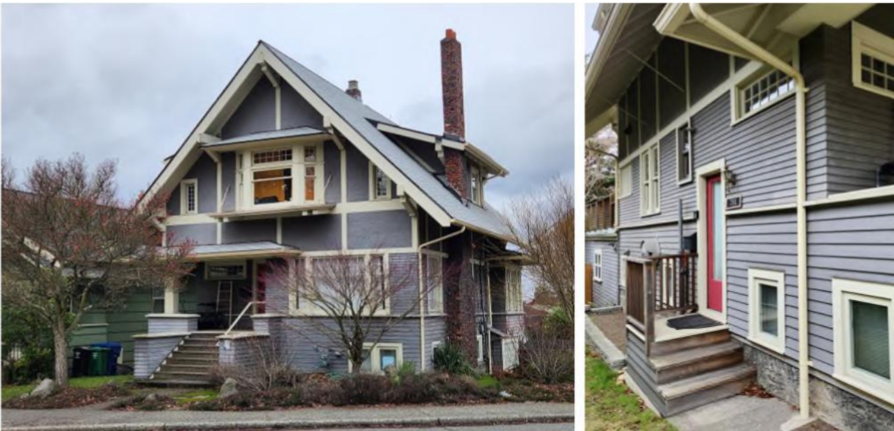
Basement AADU example, with AADU entrance on the side of the structure.

For these reasons, ADUs are an effective and “gentle” way to help accommodate the state’s growing population.