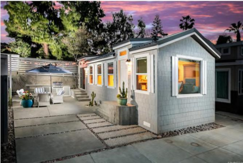
Prefab DADU: Nanny Flat, Elder Cottage.

Bremerton Municipal Code Sec. 20.46.010 – Allows for manufactured homes to be used as ADUs.