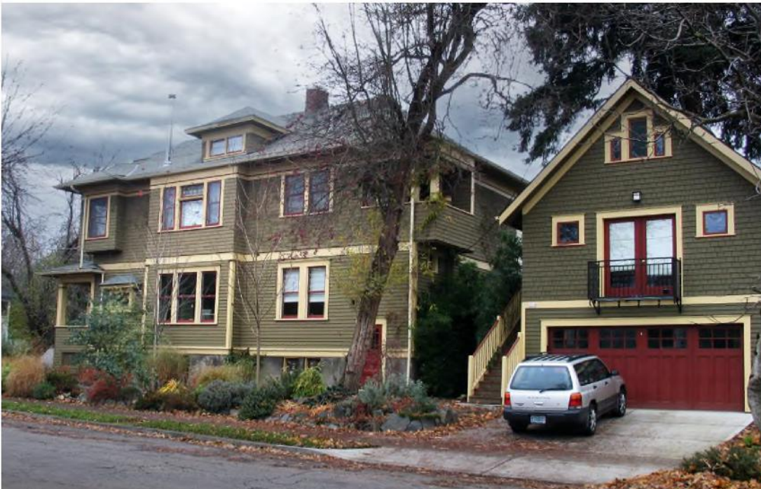
Detached ADU/"Carriage House" in Portland.

Commerce is required to develop guidance to update the 1994 recommendations. That will be completed by June 30, 2023 and posted at: https://www.commerce.wa.gov/serving-communities/growth-management/growth-management-topics/planning-for-housing/