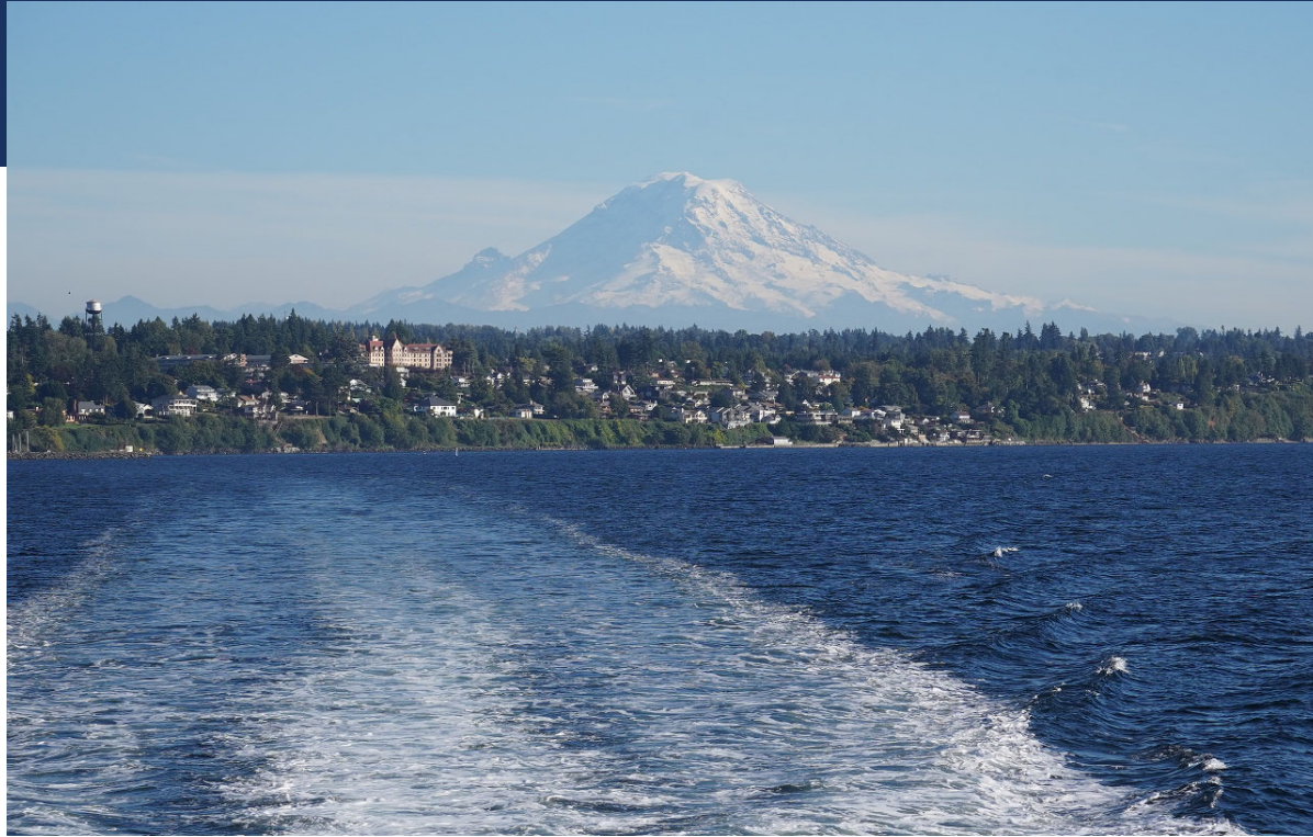
DES MOINES FERRY DEMONSTRATION PROJECT