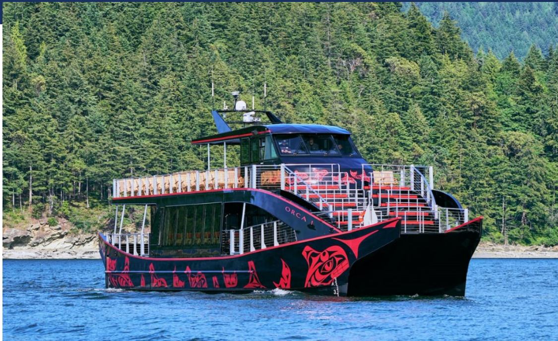
DES MOINES FERRY DEMONSTRATION PROJECT