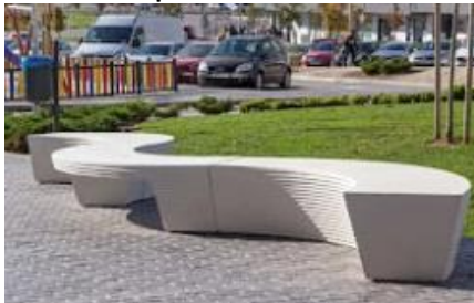
Bench Concept 5