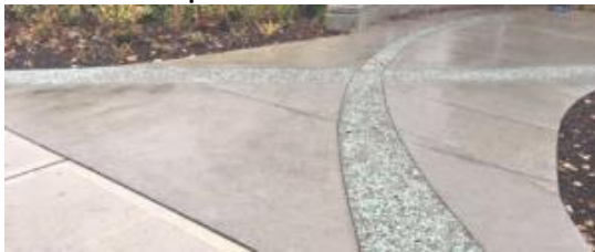
Concrete Concept 5