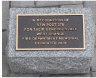
Pedestal Concept 2