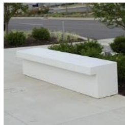
Bench Concept 2