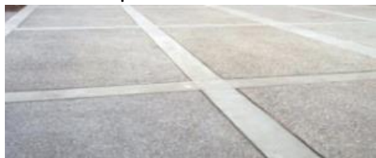
Concrete Concept 6