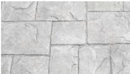
Concrete Concept 7