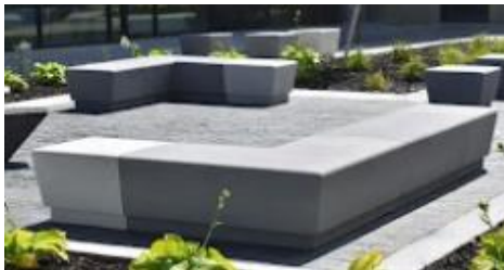
Bench Concept 3