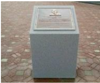
Pedestal Concept 3