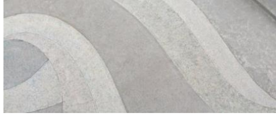
Concrete Concept 2