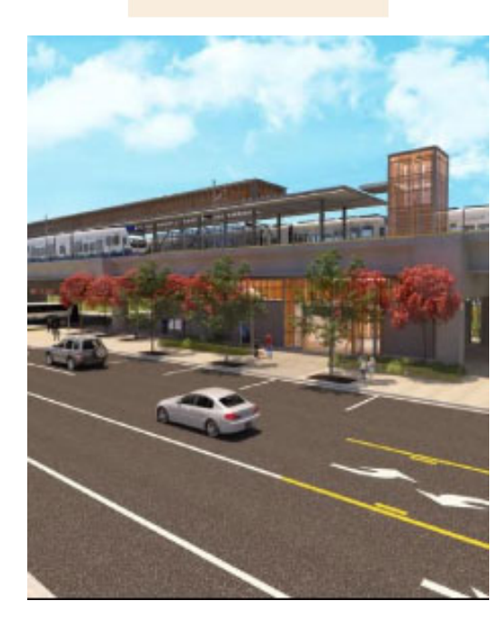
Kent Des Moines Station