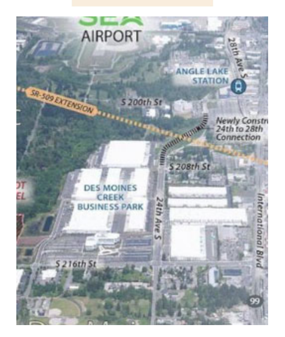
Business Park - Des Moines West