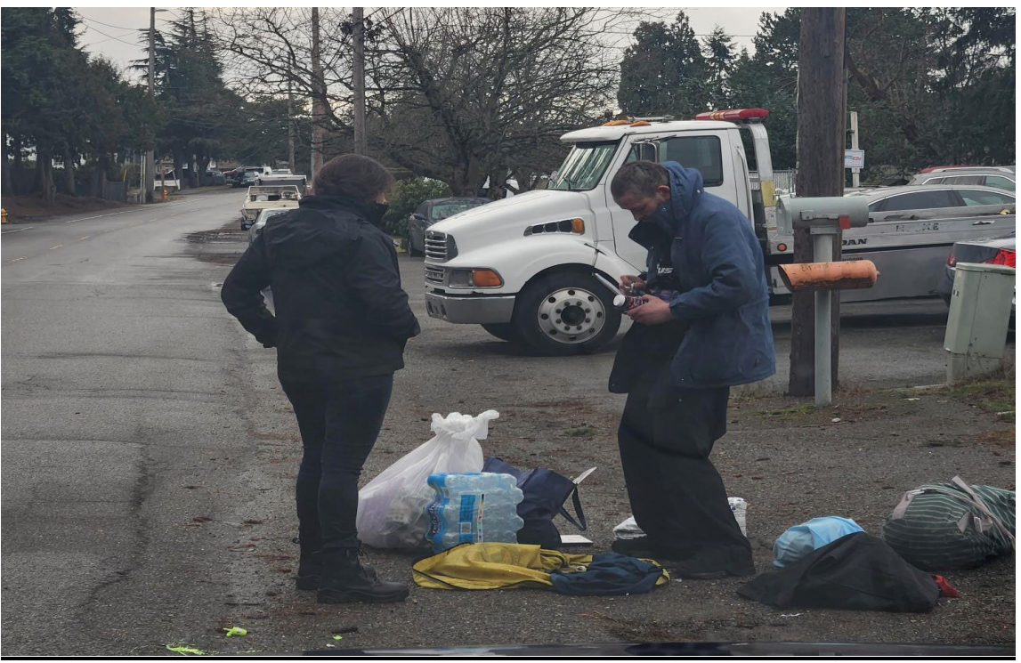
Newly hired DMPD Crisis Responder (on left) getting people connected

The GPS Team assisted patrol with a suicidal subject at the Woodmont Library. The 9-1-1 call came in as a 32 year old male who was considering walking to the nearest bridge and jumping into traffic.